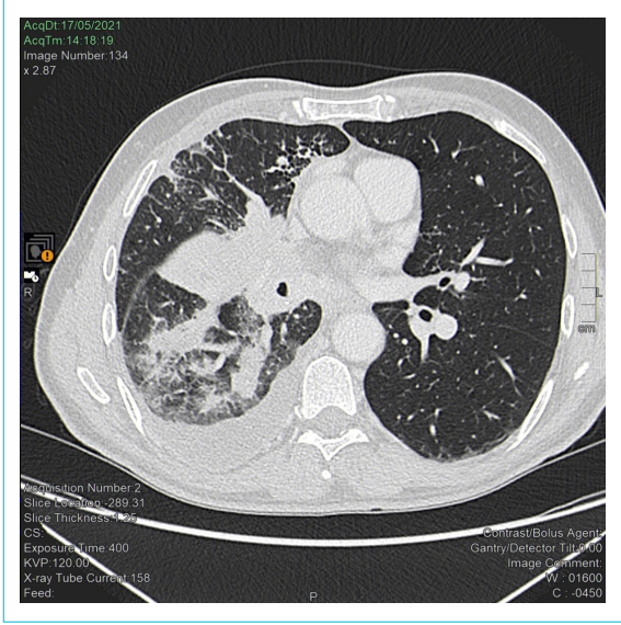
Figure 2: Computed tomography scan of the lungs after 3 months of treatment with pembrolizumab. A considerable reduction in the size of the hilar tissue is apparent 3 months after pembrolizumab initiation. The middle lobe has re-expanded and the apical segmental bronchus of the lower lobe is newly patent. Parenchymal localizations have disappeared from the lower lobe and upper lobe lymphangitis has lessened.

Figure 1: Computed tomography scan of the lungs before treatment with pembrolizumab. A neoplastic mass occupies the right hilum causing complete stenosis of both the middle lobar bronchus (with complete atelectasis of the middle lobe) and the segmental apical bronchus of the lower right lobe. The lower lobar bronchus is reduced in size, parenchymal localizations are visible in the lower lobe and lymphangitis is apparent in the upper lobe. Pleural effusion is also apparent.