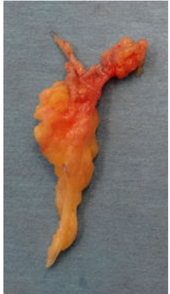
Figure 4: A Y resection of the digital nerve is carried out and the sample is sent for histopathological confirmation of the diagnosis.

depth of the exposure. Kaplan placed the incision at the root of the toes, slightly proximal to the interdigital folds. His observation of three cases showed that the exposure of the nerve was easier than through the dorsal approach, and that the incision did not interfere with weight bearing nor produce sloughing of the skin. Kaplan noted, however, that