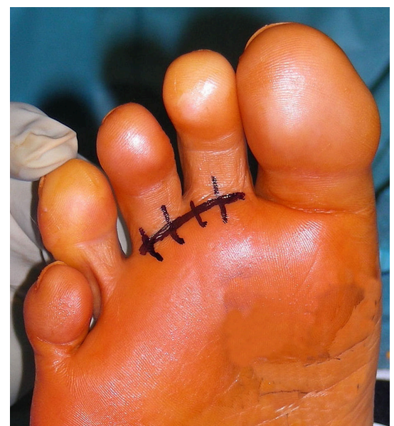
Figure 1: Distal transverse plantar incision to the second web space.

The mean FAAM score was 84.8% (range 16–100%). The mean ADL and sports sub-scores were 89.6% (range 30–100%) and 80.0% (range 4–100%), respectively. The mean VSS was 1.57 (range 0–6). Figure 5 shows representative scars at a mean of 7.9 years follow up. If needed, 86% of patients would have the operative treatment again (REDO) and 84% would recommend it to a friend