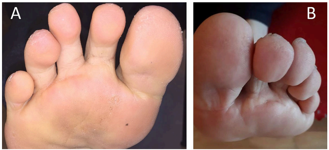
Figure 5: Representative scar samples at a mean of 7.9 years follow up in two different patients. A third web space, B second web space.

stump neuromas (21%), two painful scars (6.9%), one deep vein thrombosis and one haematoma were reported. The authors concluded that the transverse plantar approach is a viable primary choice for neuroma excision because it provides excellent anatomic exposure and easy access to the neuroma, with no stump neuroma reported. Like Wilson and Kuwada [23], we observed no recurrence. Furthermore, delayed scar healing in five patients is consistent with the observations of Kaplan [10] and similar to Wilson and Kuwada's results [23].