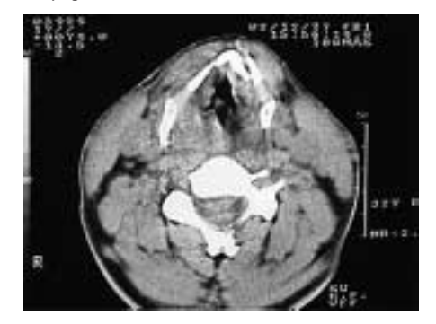
Figure 1 Laryngeal CT.

The rating of roughness (R), breathiness (B), hoarseness (H) of the patient's voice was made on a reading passage. These parameters