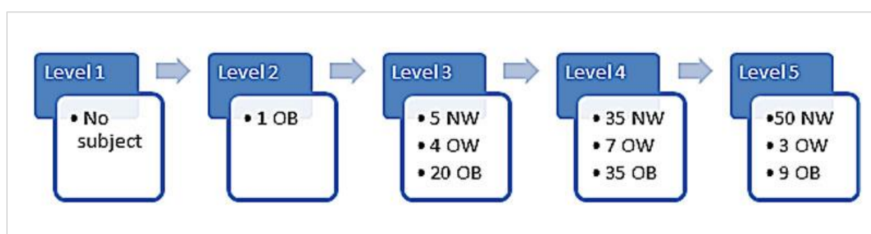
Figure 1: Characteristics of the subjects at each maximal intensity level reached. NW = normal weight; OB = obese; OW = overweight

Tobit models were applied to the VO_2 measurements adjusted for age, gender, BMI z-score, and intensity level. BMI z-score and age were negatively associated with VO_2 , and girls had on average lower VO_2 values than boys. The negative effect of BMI z-score on VO_2 was stronger at higher intensity levels, and the gender difference was also greater at higher levels.