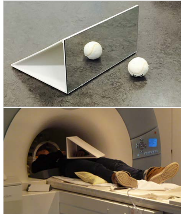
Figure 1: The experimental setting. A customised mirror box made out of plexiglas and wood was used for the experiment (left panel). Patients lay on their back in the scanner with their arms comfortably resting on the scanner table alongside their torso and with their elbows slightly flexed. A mirror was attached to the head coil above the head allowing the participants to view their hands (right panel).

tests, a primary threshold of p < 0.001 at voxel level and a cluster-extent threshold at family-wise error rate (FWER) for multiple comparison correction was used. Age and MACS were used as covariates for patients, age for controls.