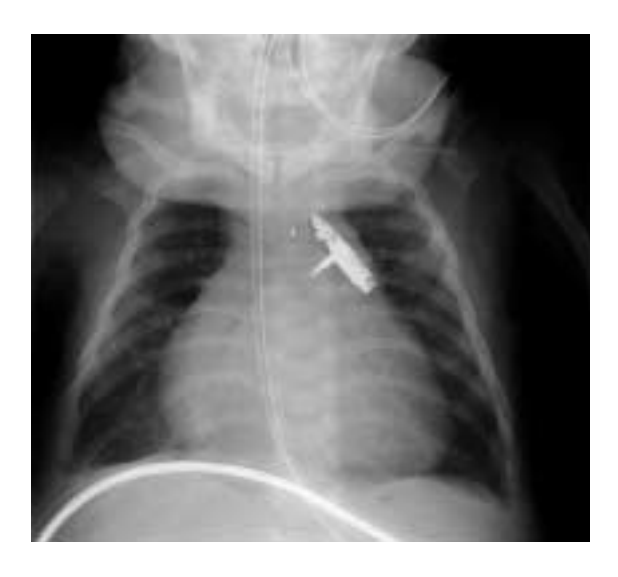
Figure 1 Postoperative chest X-ray showing the FloWatch™ implanted around the pulmonary artery.

and FloWatch<sup>TM</sup> implantation around the pulmonary artery through conventional left thoracotomy. The surgical procedure was rapid and uneventful. During the entire postoperative period (fig. 1) bedside adjustments (narrowing or release of pulmonary artery banding with echocardiographic assessment) were repeatedly required to maintain an adequate pressure gradient.